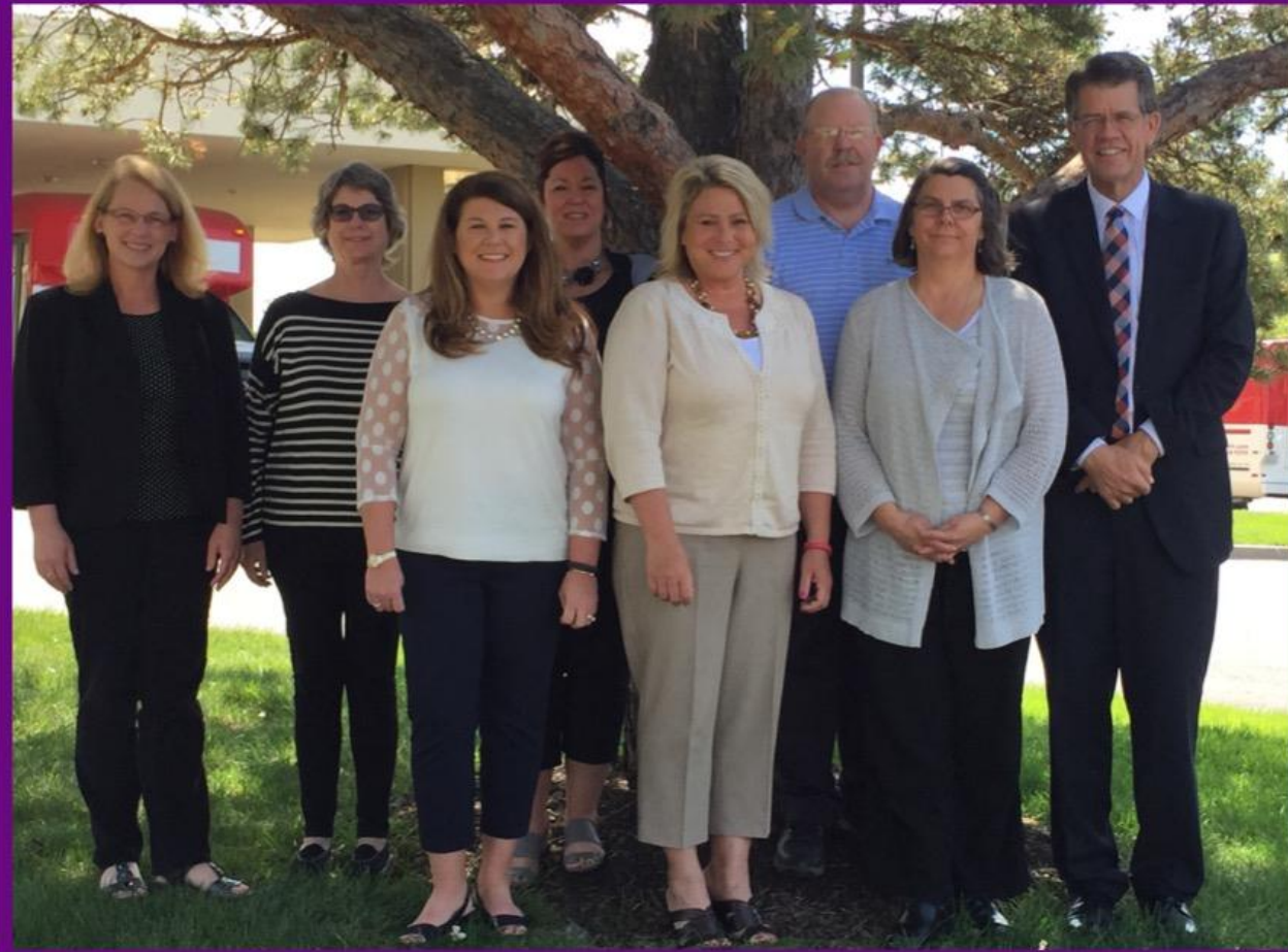
Heartland EHDl Meeting April 29, 2015