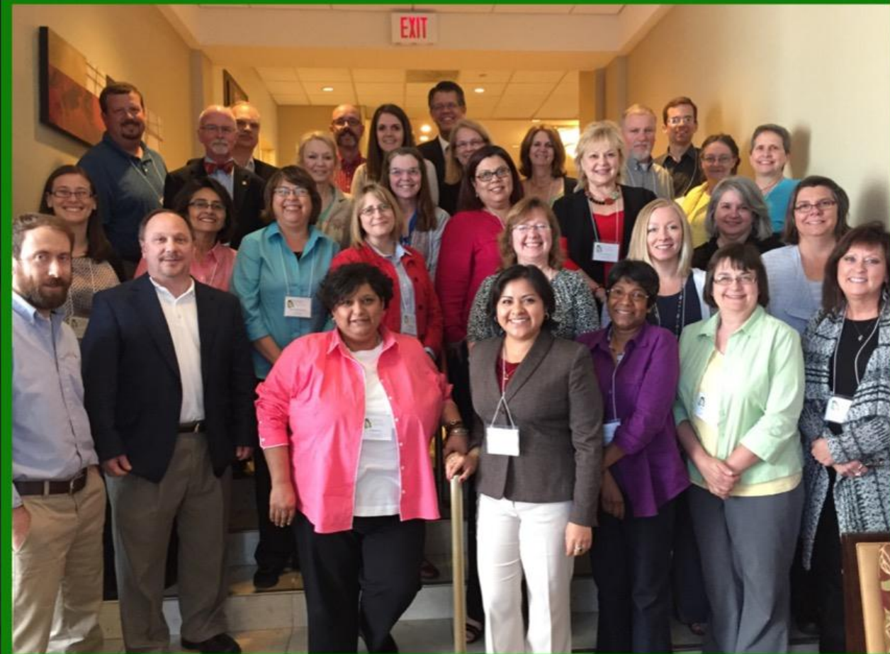
Heartland Advisory Board Meeting April 29, 2015