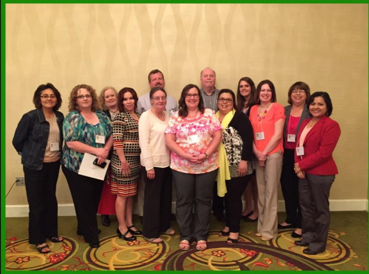
Heartland Advocate Meeting April 30, 2015